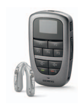
Tek gives you wireless control of all your audio devices.

Make that call, hear that new song, indulge in your favorite film. Tek Connect makes it all possible. Wirelessly. Seamlessly. Effortlessly.