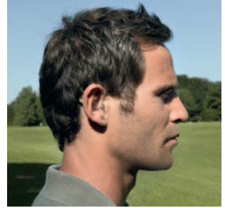
Nitro BTE provides physical and hearing comfort.