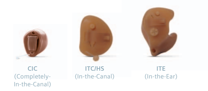
*Available for Nitro 701 custom (ITC and ITE)

Automatically adapts to your volume and sound preferences, for each individual listening environment.